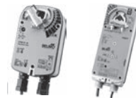
Actuators - pg. 9-10