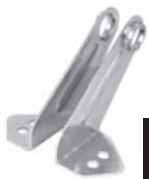
HIGH BLADE BRACKET