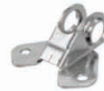
LOW BLADE BRACKET